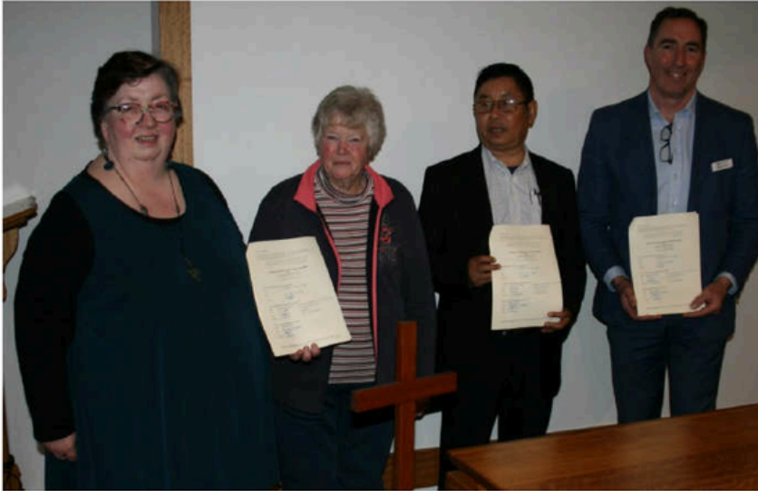
The Memorandum of Understanding signed on Wednesday formalises the relationship between the Tasmanian Chin Christian Church and the Launceston North Uniting Church and Presbytery of Tasmania.