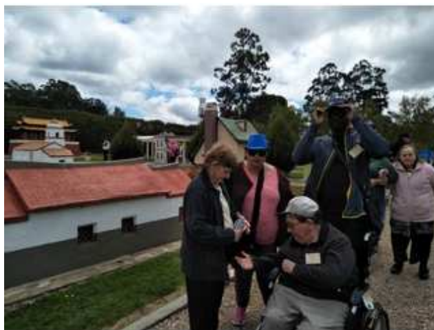
Enjoying time together in 2019