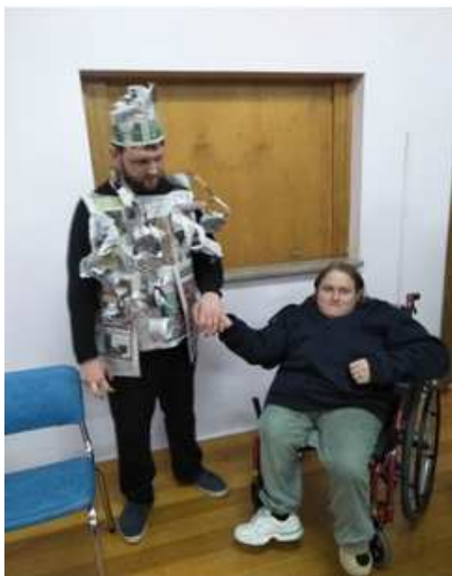
Two of our members having fun

Crossroads people are still staying in touch, with phone calls and cards. They have deferred their annual holiday weekend until October and have plans in place for this. Below you can see some pre-Corona pictures from events held.